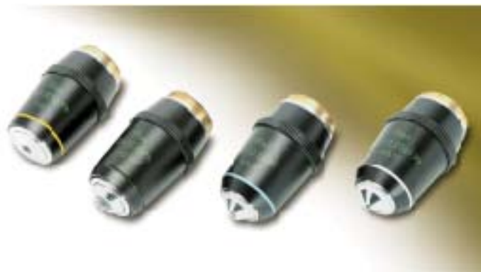
CCIS EF Plan Phase Achromat Objectives